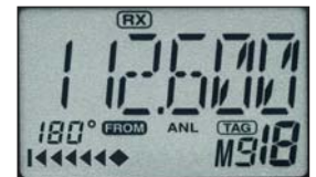
CDI mode display

The IC-A24/E has VOR navigation functions. The DVOR mode shows the radial to or from a VOR station and the CDI mode shows the course deviation to/from a VOR station. You can also input your intended radial to/from the VOR station and show the course deviation on the display. In the USA version, the duplex operation allows you to call a COM channel, while you are using VOR navigation. (* IC-A24/E only)