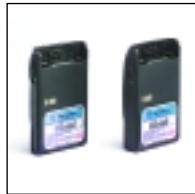
JMNN4023/4024 Slim & Hicap Lilon Batteries