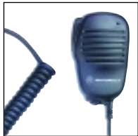
JMMN4067 Remote Speaker Mic