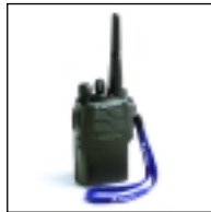
JMZN4020 Radio Wrist Strap

Not pictured: Single Rapid Charger HTN3006 Multi-Unit Rapid Charger TNTN4031A