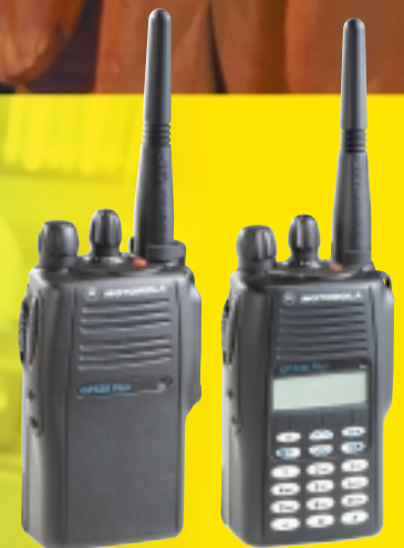
GP328 Plus & GP 338 Plus Professional Portable Radios