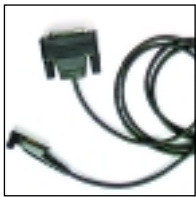
JMKN4123 Programming Cable

A comprehensive range of accessories is available so that the radios can be customised to suit your needs. Adding the proper headsets, microphones, batteries, charger or carry cases can enhance your operational productivity. Motorola's accessories are built with the highest quality standards and are specially engineered to assure maximum performance of your radio, no matter what profession you're in.