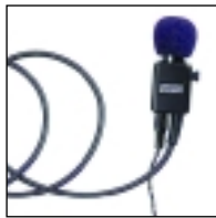
JMMN4062 Earpiece with Mic/PTT