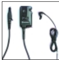
JMMN4064 Ear mic VOX/PTT Interface Module